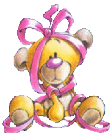
table de 3