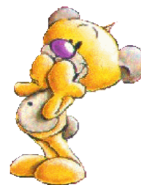
table de 5